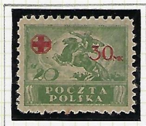
20m + 30m: green.

Colour variations of the Overprint in carmine exist. Stamps and Overprints by the Printing Works of the Ministry of Posts and Telecommunications in Warsaw. Quantities: 100,000 each. Valid until 15.8.1922.