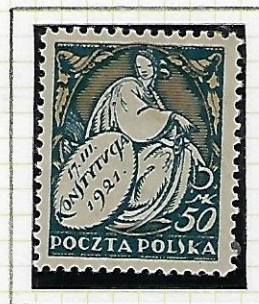
50M: myrtle-green and buff.