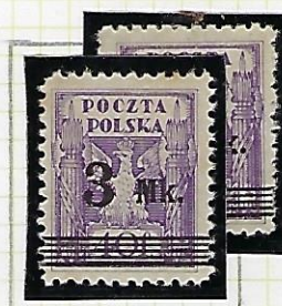
3m on 40f bright violet Type B 2.8-3mm between "3" and "Mk."

Several different Overprint letters are known. Quantity: 6,000,000 in total. Valid until 15.8.1922.