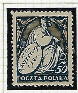
50m: myrtle-green and buff.

Printed typography by the Printing Works of the Ministry of Posts and Telecommunications, Warsaw, on smooth medium white paper and issued in sheets of 10 x 10. Bronze-ish gum. Line Perf. 11 or 11½. Quantities: unknown.