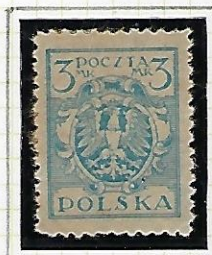
3m: pale blue.