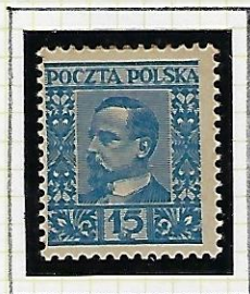
15gr ultramarine: Sienkiewicz. Very thick paper. Clear gum.

These stamps were from printings in 1929 - 1932.