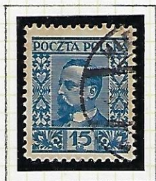
15gr blue: Sienkiewicz. Medium paper