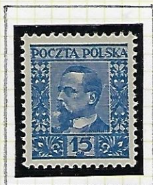
15gr ultramarine: Sienkiewicz. Medium paper. Gum yellowish hue.

Plate I. Colours: (a) ultramarine, printed on (i) medium, smooth white paper, and (ii) thick, smooth white paper. (b) blue, printed on medium, smooth white paper.