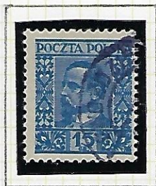
15gr blue: Sienkiewicz. Medium paper. Gum yellowish hue.

These stamps were from printings in 1929 - 1932.