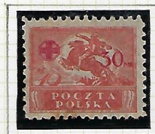
10m + 30m: vermillion.