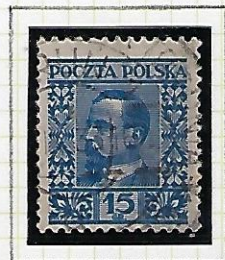
15gr greyish blue: Sienkiewicz. Medium paper

Quantity: 15gr Pl.I ultramarine 60,000,000; Pl.I blue 30,000,000; Pl.II 100,000,000. Valid until 1/6/1936.