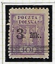
3m on 40f bright violet Type A 3.5mm between "3" and "Mk."

26 Jan. 1921: 40f bright violet Eagle Between Ensigns of Authority , Barto- miejczyk Design, surcharged "3 Mk." and five horizontal lines obliterating the 40f value. There are two types: (A) with 3.5 mm distance between "3" and "Mk", and (B) with 2.8 to 3 mm distance.