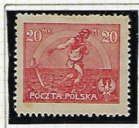
20m: brown-red Sowing Peasant.