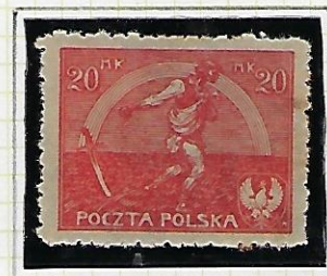
20m: rose-red Sowing Peasant.