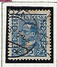
15gr bright blue: Sienkiewicz. Medium paper

Plate II. Colour: bright blue (but there are very slight variations): ( 18\frac{1}{4} \times 22 mm)