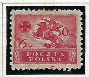
6m + 30m: rose-carminé.