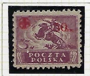
5m + 30m: purple.

5 March 1921: Surcharge for the Benefit of the Red Cross Fund. Overprints in red "☒ 30MK" on the Polish Uhlán (Design E. Barto- Ł miejczyk) stamps of 5, 6, 10 and 20m of Feb. 1920, only in the Perforation 9.