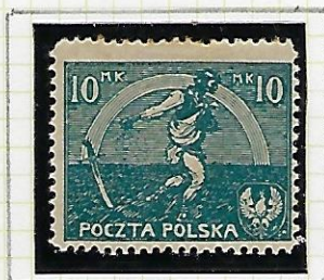
10m: blue-green Sowing Peasant.

Size 27\frac{1}{2} x 21\frac{1}{2} respectively 25\frac{1}{2} x 21mm: