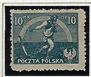
10m: slate-green Sowing Peasant. (no gum)