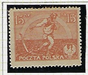
15m: brown Sowing Peasant.