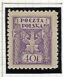
40f: bright violet.

May 1920: Eagle Between Ensigns of Authority Design by E. Bartołomiejczyk with Redrawn Value Tablet (new Value with larger figures and larger "f" for "feni-gów"). Printed typo on thick wove paper. Perf. line 10 to 11\frac{1}{2} and compounds.